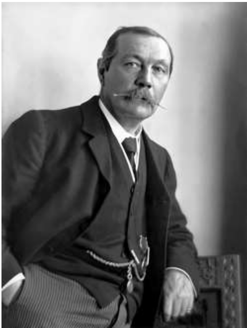
Arthur Conan Doyle

Sir Arthur Ignatius Conan Doyle (22 May 1859 – 7 July 1930) was a British author and doctor. In 1887, he introduced the character Sherlock Holmes in A Study in Scarlet , which became the first of four novels and fifty-six short stories featuring Holmes and Dr. Watson. The Sherlock Holmes tales are considered landmark works in the genre of crime fiction.