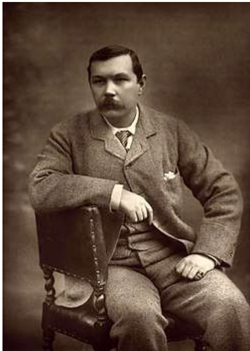
Portrait of Doyle by Herbert Rose Barraud, 1893