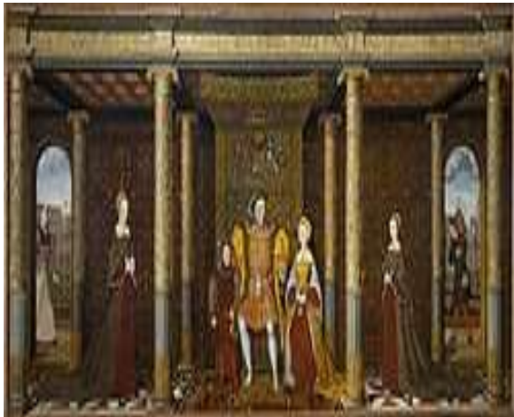
The Family of Henry VIII, c. 1545, at Hampton Court Palace; unknown artist

The English Renaissance was a period of cultural and artistic renewal in England that unfolded from the late 1400s through the 1500s and into the early 1600s. It formed part of the broader European Renaissance, which began in Italy in the late 1300s. Like much of Northern Europe, England did not experience these influences until over a century later, during what is known as the Northern Renaissance. Renaissance ideas reached England gradually, and the Elizabethan age in the latter half of the 16th century is often considered the peak of this movement. Some researchers trace its origins to the early 1500s under Henry VIII, while others claim it had already emerged in the late 15th century. Unlike the Italian Renaissance, the English version