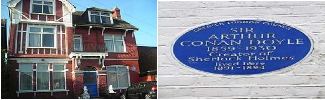
Doyle's house in South Norwood, Croydon, south-east London, and right, a close up of the commemorative blue plaque at the address

Between 1888 and 1906, Doyle wrote seven historical novels, which he and many critics considered his finest works. In addition, he produced nine other novels and, later in his career (1912–1929), five stories—three of which were novels or novellas—featuring the irritable scientist Professor Challenger. Among these, The Lost World stands out as his most famous work after the Sherlock Holmes stories. His historical novels include The White Company and its prequel, Sir Nigel , both set in the Middle Ages. Doyle was also a prolific short story writer, including two collections set during the Napoleonic era that feature the French character Brigadier Gerard.